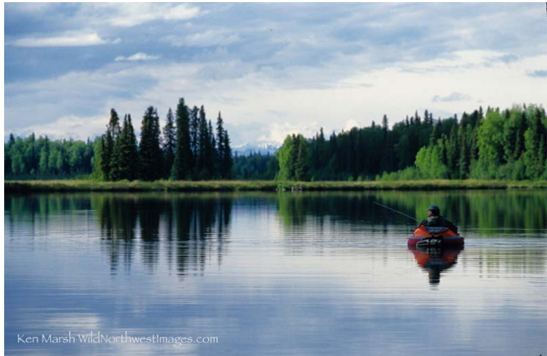
Anglers enjoy good fishing and plenty of solitude in Valley lakes.