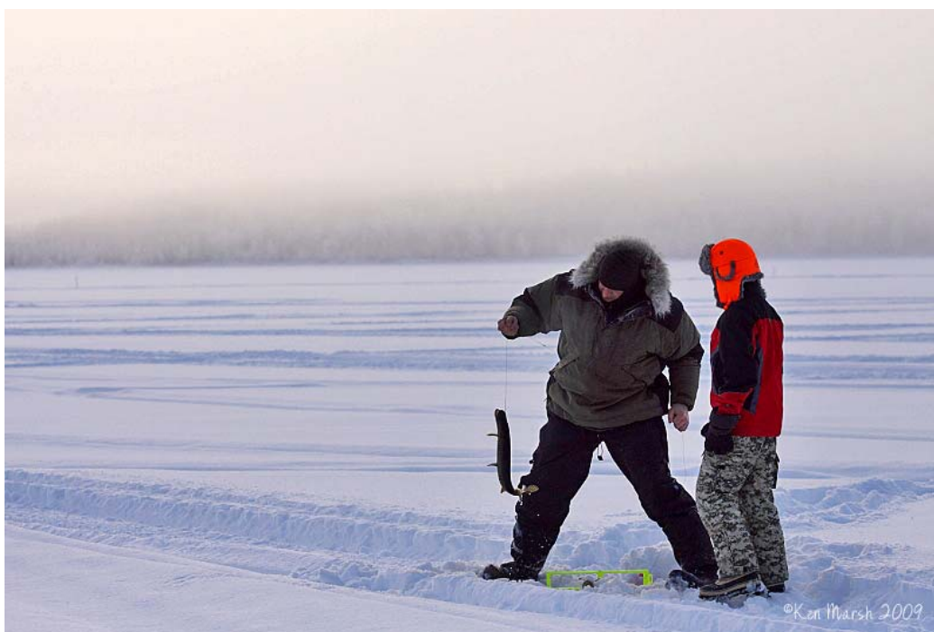
A father and son target northern pike through the ice. Valley lakes offer good fishing year round.

ministrative Code 11.20.540 - 555 and 11. 20.905-990)